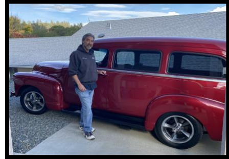
"Donnys New Ride"