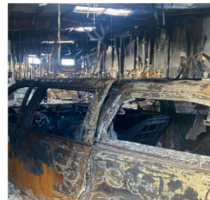
Lahaina Fire 🔥🔥 Damage 😞